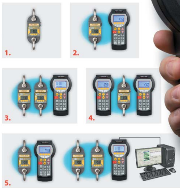
Optional Remote Communicator II