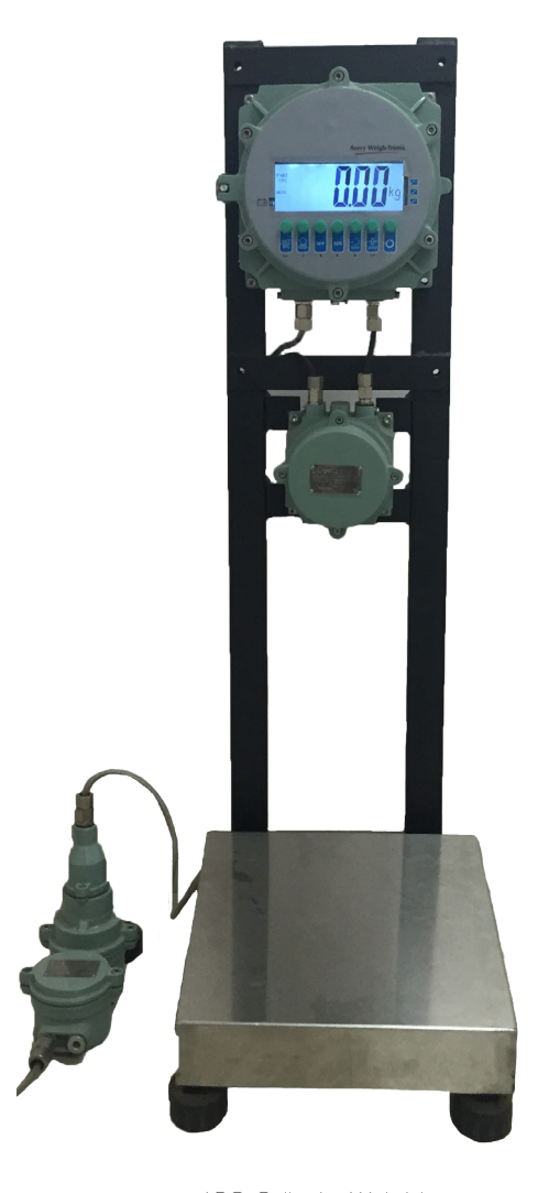
LPG Cylinder Weighing

Approvals – Approved as per Legal Metrology Act and Petroleum Rules.